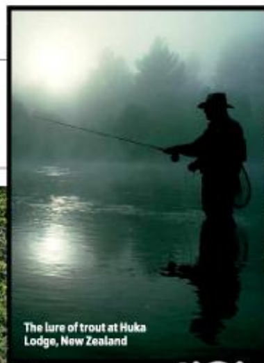
The lure of trout at Huka Lodge, New Zealand

I get my enjoyment from outwitting a trout with the fly, being able to admire its unique markings (every one of them is different – a bit like human fingerprints) and then watching it swim back to its lie knowing that one day I may have the chance to outwit it again.